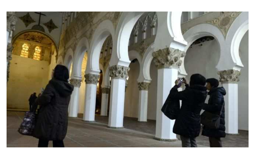
The Spanish government calls the expulsion of tens of thousands of Jews in 1492 a "historic mistake"